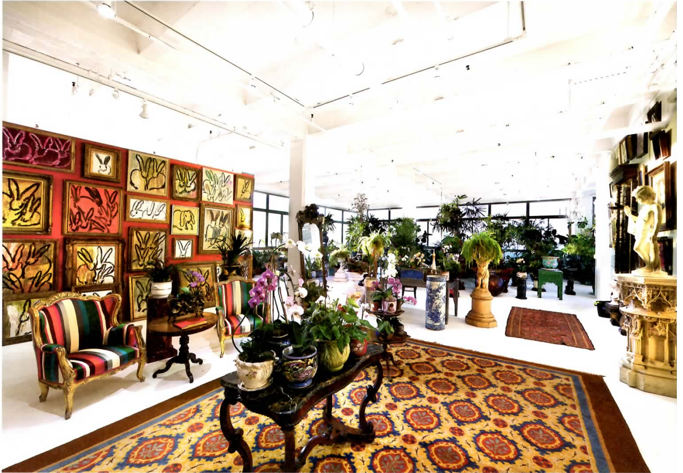
Above: Hunt Slonem's studio on the top floor of the Whale Industrial Terminal Building, Brooklyn. It has huge, open floors, large windows, 17-foot ceilings and 360-degree views. Far right: Hunt Slonem at work. Below: the view from his studio.

My whole life could be summed up by the word exotica.